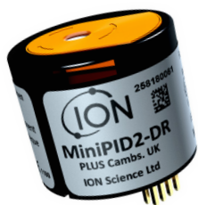
MiniPID 2 sensor