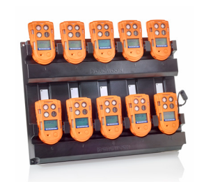
10 way charger For charging and storing your T4 fleet